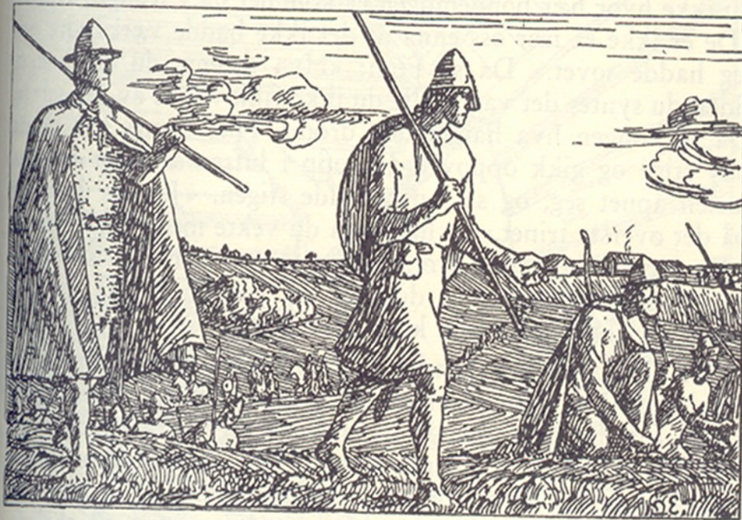
På hver sti drev det folk.